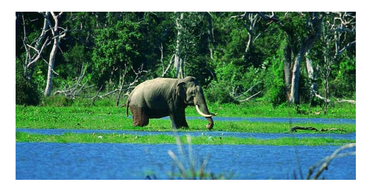
DAY 04 DAMBULLA / MATALE / KANDY – THILANKA HOTEL (03 star) (Distance between Dambulla to Kandy – 80 KMS)

After breakfast, leave for Kandy. En-route visit a Batik factory and a spice garden at Matale. Arrive in Kandy and check-in to hotel. Kandy is the last Kingdom of Sri Lanka, which was conquered by the British in 1815. Evening Kandy city tour and witness a Kandyan cultural dance performance.