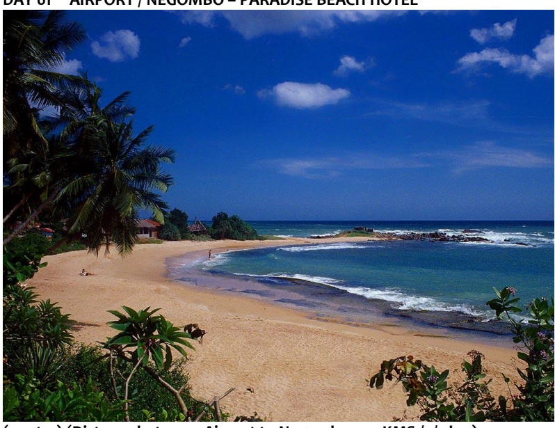
(03 star) (Distance between Airport to Negombo – 15 KMS / 1/2 hrs)

Arrive in Sri Lanka. Met on arrival by our company representative & tour guide. Free refreshments - mineral water & fresh fruits (Pineapple & Banana) will be served in the coach. Thereafter transfer to hotel and check-in. Leisure. Dinner and overnight stay.