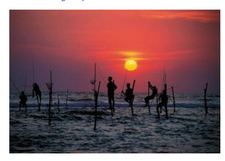
DAY 10 HIKKADUWA / AIRPORT – DEPARTURE (Distance from Hikkaduwa to Airport 140 KMS) After breakfast transfer to Airport in time for the departure flight.

After breakfast, visit the Kosgoda Turtle Hatchery and return to hotel. Ride in a glass bottom boat to witness the coral reef. Spend the rest of the day at leisure by the beach or pool side. Dinner and overnight stay.