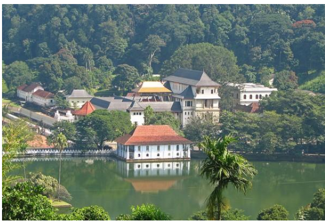
Visit the Kandy Temple, where the sacred tooth relic of Lord Buddha is placed in a chamber. About 1000 devotees worship at the temple everyday. Dinner & overnight stay.

After breakfast, leave for Kandy. En-route visit a Batik factory and a spice garden at Matale. Arrive in Kandy and check-in to hotel. Kandy is the last Kingdom of Sri Lanka, which was conquered by the British in 1815. Evening Kandy city tour and witness a Kandyan cultural dance performance.