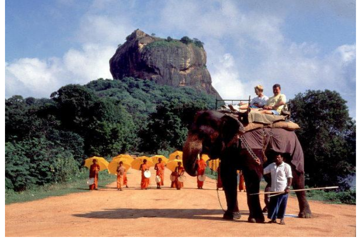
Leave for Minneriya Wild Life National Park and Jeep safari to watch wild Asian Elephants. Evening return to hotel for dinner and overnight stay.

After breakfast, leave for Habarana and visit an Ayurvedic Medical Centre, where a qualified doctor will give a brief description of the benefits of these indigenous medicines to the human body. Thereafter ride in a Bullock cart to the Habarana Lake. Get in to a boat and paddle to the other side of the lake and arrive at a village. Walk through the village and visit a mud-house. Here you will be serviced a typical Sri Lankan rice & curry meal on a lotus leaf. Return to Habarana and enjoy a 01 hour Elephant ride near the Lake.