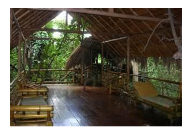
DAY 07 ELLA - ELLA ADVENTURE PARK

After breakfast, Mountain Bike ride & trekking to visit the Belilena caves, which is about 8 km from Kitulgala through Inoya Estate. It is a large prehistoric cave where the 13,000 years old skeletal remains of 'Balangoda Man' (Homo Sapiens Balangodensis) were found. No recent cave excavations have been done up to now it is known that the earliest settlement dates back to around 32,000 years ago. Return to Rafters Retreat and check-out. Leave for Ella and check-in to Ella Adventure Park. En-route visit the beautiful Devon & St. Claire water-falls. Dinner and overnight stay.